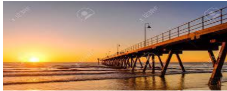
Glenelg Jetty Sunset