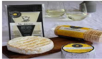
The Barossa Cheese Factory