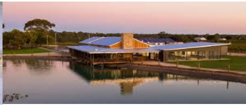
The Barossa Chocolate Factory