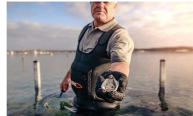
Fresh sea food, Coffin Bay Oysters