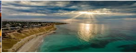
Port Willunga near the world renown McLaren Vale wine region