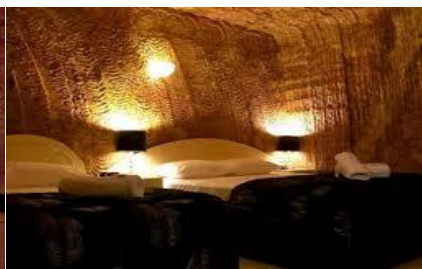
Sleep underground in an Underground Motel, Cooper Pedy

Jeremy Clarkson, English broadcaster, journalist and writer when commenting on the Adelaide built Aussie engined HSV VT GTS Series 1 said "if you want a true muscle car and don't buy one of these Australian muscle cars, you're insane". Imagine what he would have said if he actually visited Adelaide and enjoyed the food, wine and surrounds.