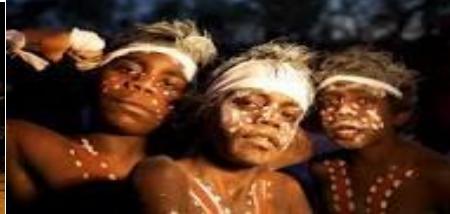
Tandanya Aboriginal Cultural Institute Adelaide