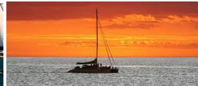
Temptation Sailing Charters Glenelg