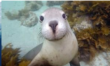
Dive with the Great White Shark or swim with sealions at Port Lincoln.