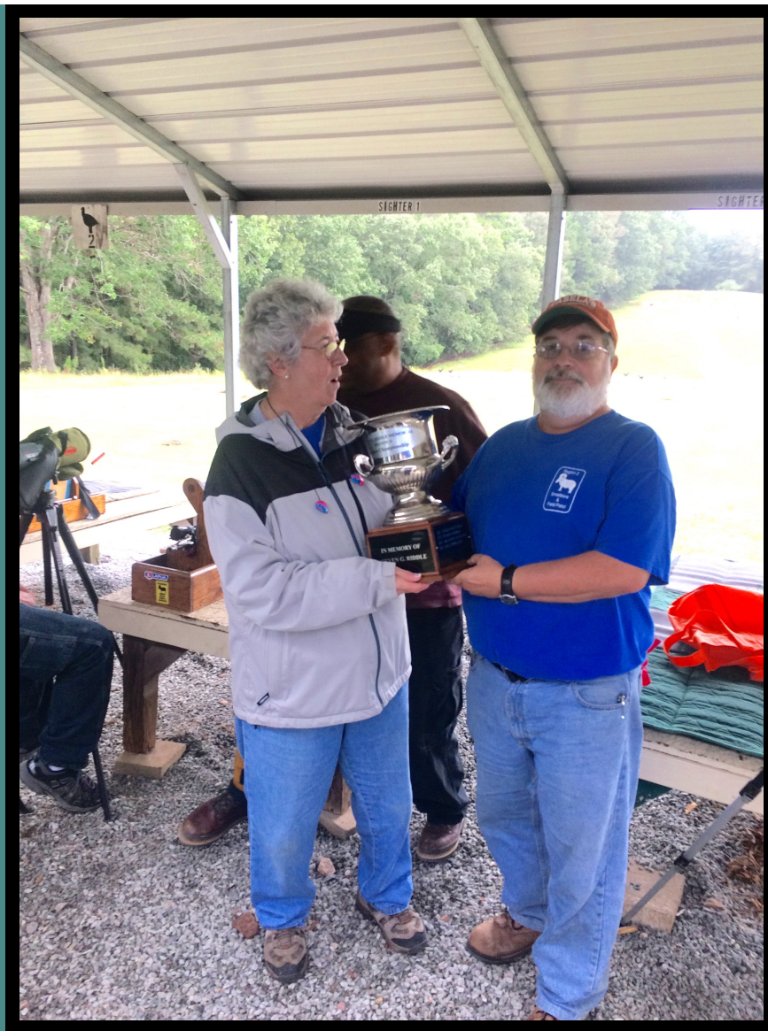
2015 Recipients of the Steven G. Riddle Memorial Region 2 Trophy